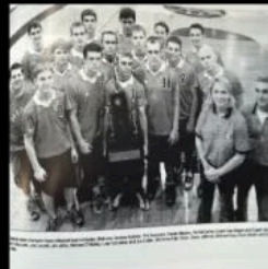
2002 Men's Volleyball Team State Champions