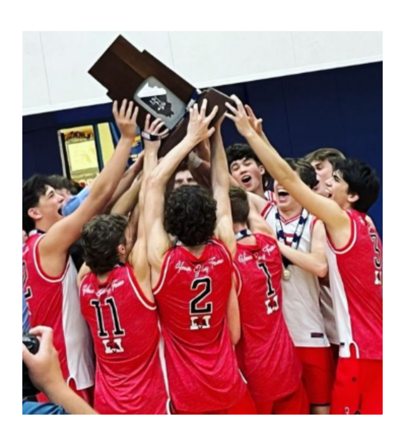
Boys Volleyball: IL State Champions!