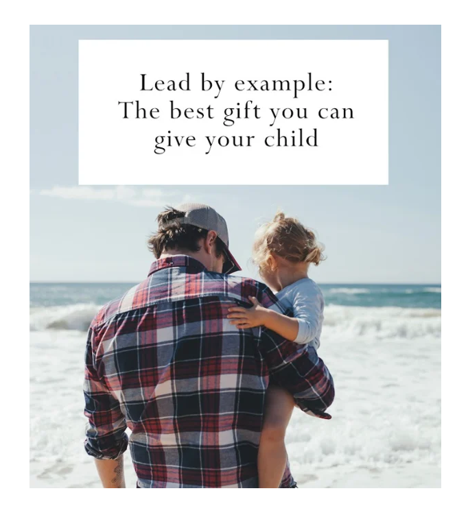
CURRENT SCHOOL NEWS